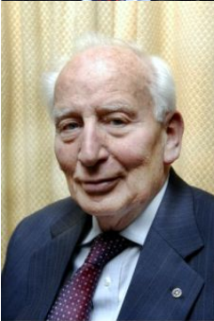
□ □ □ □