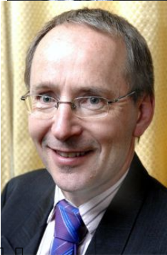
□ □ □