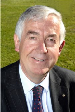
□ □ □ □