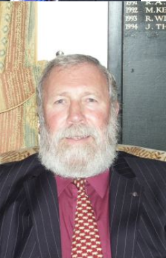
□ □ □